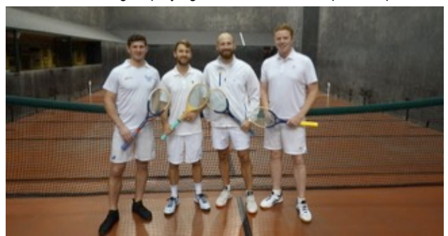
U.S. Professional Singles playing for the Schochet Cup - Newport, June 2019

National League Match - New England vs New York @ New York, October 2019