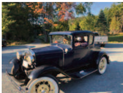
Ride shotgun in the 1931 Ford Model A