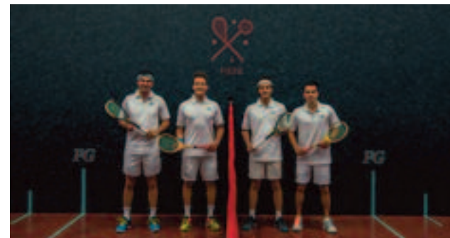
National League Match - Chicago, October 2018