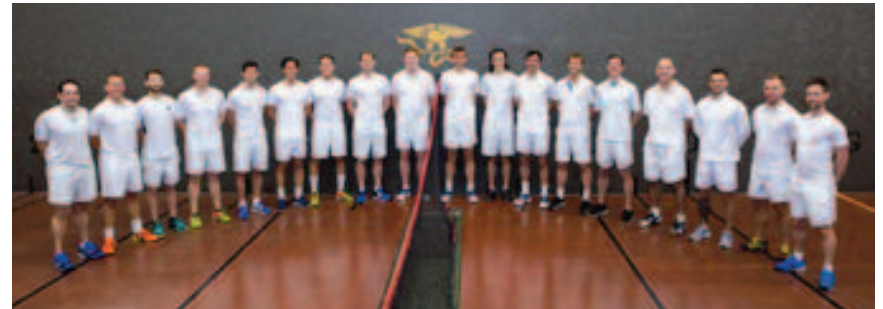
U.S. Professional Singles playing for the Schochet Cup – Newport, June 2018

Please help us support our professionals and raise your hand for Lot 12.