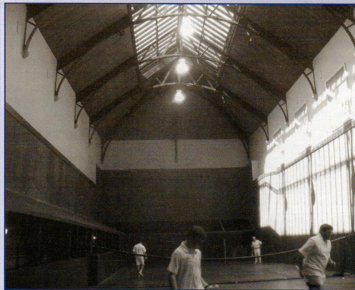
The USCTA Board of Governors spent a day at the Georgian Court in Lakewood, New Jersey, on September 11, 2005 to check on progress of the restoration of the famed Jay Gould court. Some of the Governors had a chance to play on the court, which has been retrieved from the world of "lost courts" through the energetic and active presence of the USCTA and the Preservation Foundation.